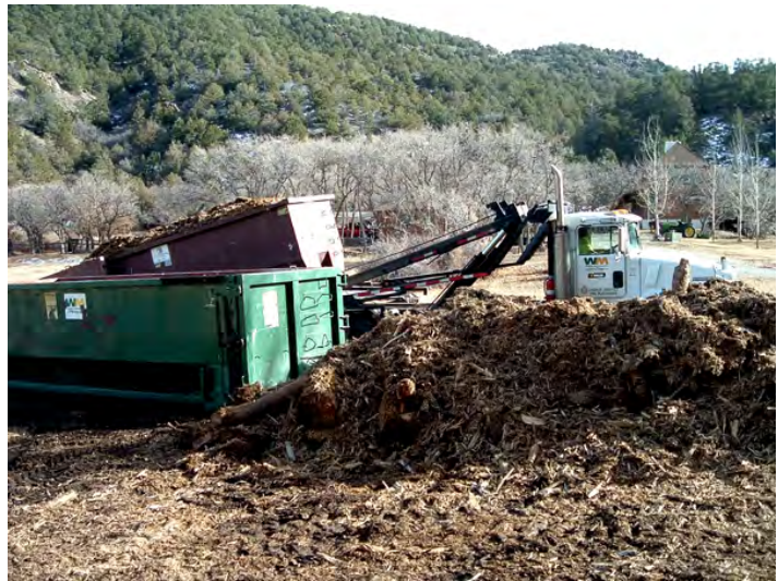
Waste Management truck loads roll-off dumpster from Tucker pile in Fremont County to haul to City of Salida site.

The arrival of a new contractor in Salida allowed us to finally complete our project. The Arkansas Valley Grinder was contracted for 60 hours of machine time at 6 sites. An estimated 7,000 cubic yards of slash yielded about 2,500 yards of wood chips.