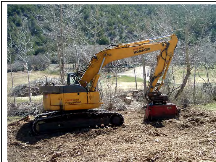
Fecon grinder finishes slash pile. This pile was later hauled away for composting.

A meeting was held with representatives of BLM, USFS and CSFS to consider options. Although not a preferred option, consensus approval was given to burn the slash piles over the winter, if possible.