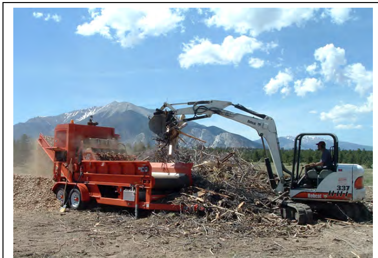
A mini-excavator is used to load slash on a Shred-All 5600 horizontal grinder.

Despite the many difficulties encountered during 2 years of delays, this project was a success. Fire mitigation has continued at a substantial pace.