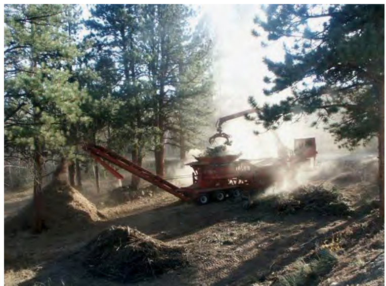
The Morbark 1300 tub grinder finishes off the Mesa Antero pile in 2003. The chips were spread in the park as grinding progressed.

At the time the 2004 grant was awarded, approximately 2,500 yards of chips remained at the Buena Vista rodeo grounds site, while the slash pile had grown to about 6,000 cubic yards during the winter months.