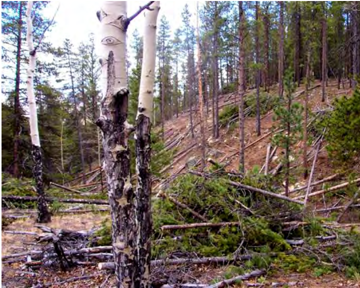
Inmate crew thinning on USFS property adjacent to 3 Elk subdivision.

Our original estimate was for 3 to 5 acres production per day in saw-intensive thinning on both public and private lands, when using the 12-man crew. While the daily acreage varied widely depending on fuel type and treatment, we treated 72 acres.